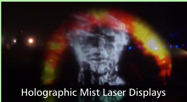
Holographic Mist Laser Displays

Environmentally friendly state of the art hologram, laser and LED lighting effects throughout the Town would compliment events all year round, be it a zero-pollution Bonfire Night, dramatic Christmas lights, the Kimberley Jam laser show, cascading poppies on Armistice Day or .... a very spooky green Halloween. Folk will come from miles around to see the Quirky Kimberley Illuminations.