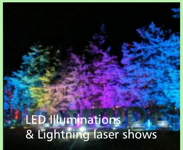
LED Illuminations & Lightning laser shows